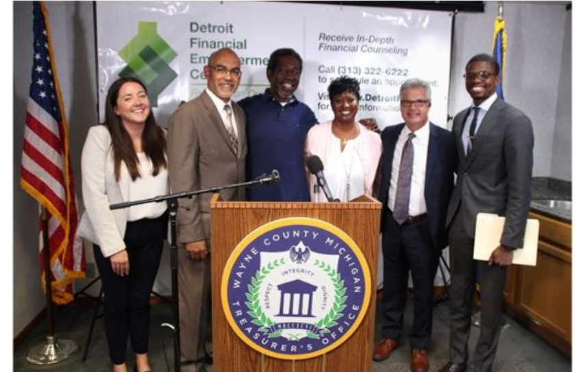
FEC Launch Event, Detroit