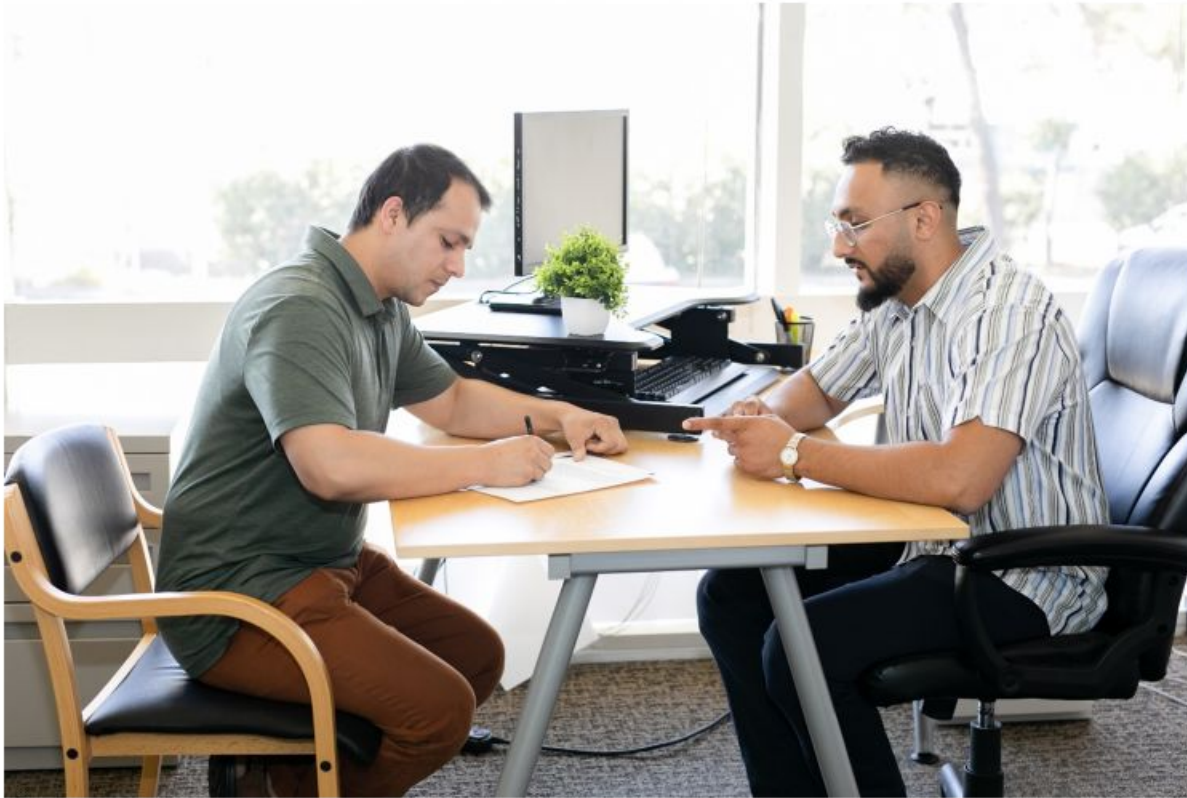
FEC Client and Counselor, Sacramento

The Financial Empowerment Center initiative offers professional, one-on-one financial counseling as a no-cost public service for all residents.